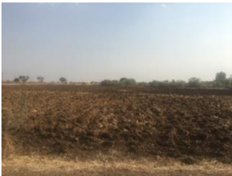
GG1990495: Rejuvenation of Farm Wells, 2 Community Tanks and Water tanks for cattle in Rural India, Marathwada / Budget: USD 43,250.00 / Kein Beitrag, aber Rolle Internationaler Partner